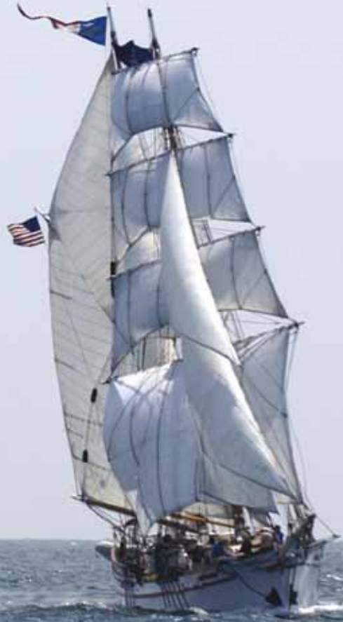
Youth become part of the crew!