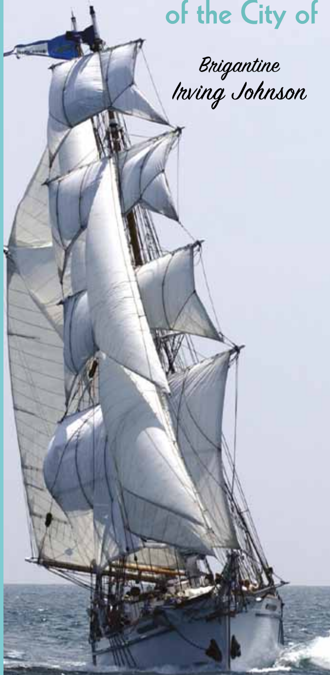
Adventure Education Under Sail